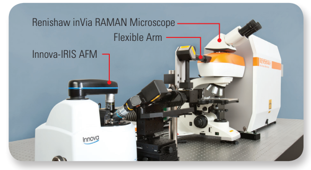
View of fully integrated Innova-IRIS and inVia system.

The Innova-IRIS integration with the Renishaw inVia fully preserves the uncompromised performance, power and flexibility of both the AFM and Raman microscopes. Each utilizes its own full-featured, real-time control and data analysis package. The result is a single integrated system that enables the correlation of complementary nanoscale topographic, thermal, electrical, and mechanical information. Ultimately, Innova-IRIS frees researchers to focus on what is most important in their work—scientific discovery.