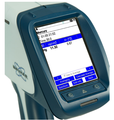
Intuitive touchscreen user interface for operation and results

Although Hg can start at low ppb/ppm levels in feedstock, it can develop into much higher concentrations over time during processing, transport and storage. Costs associated with decontamination of equipment can be significant. Consequently, it is important to screen for mercury contamination as part of a regularly scheduled preventative maintenance program. Bruker's handheld S1 TITAN 800 or 600 XRF offers a quick and cost effective way to determine Hg levels in equipment.