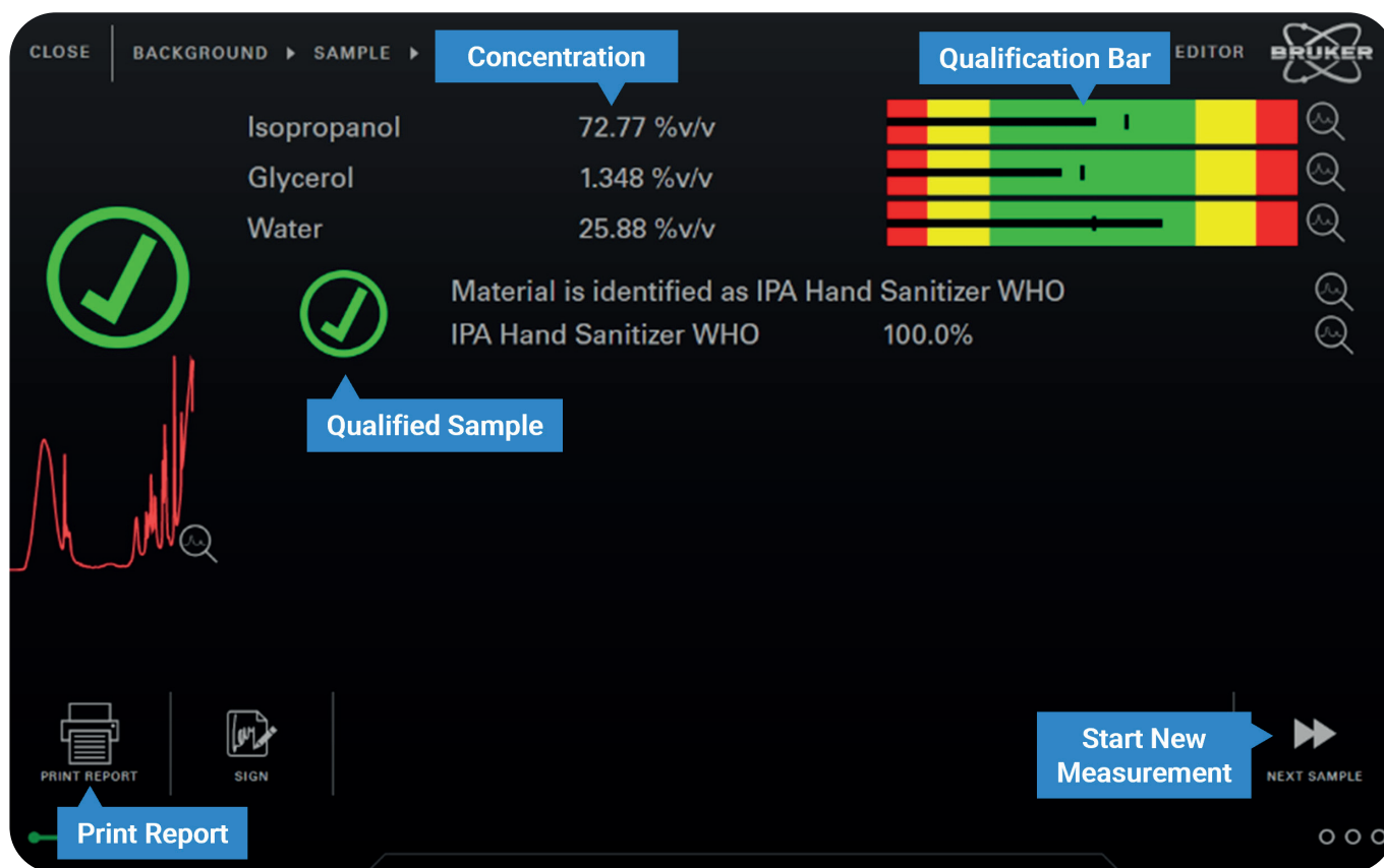
Figure 2: A customer's MEV final result screen shown from OPUS TOUCH. All information is clearly displayed so even untrained operators can interpret the evaluation result. The hand sanitizers critical parameters like water, alcohol, and glycerol content is within good limits (green pass). User's can now sign the results, take a look at the report or continue, automatically saving a report on the file.

Whether you need to get a pass/fail decision from a quantification, or have to apply multiple evaluation methods on your sample's IR spectral data, MEV enables you to perform the analysis with maximum ease and efficiency.