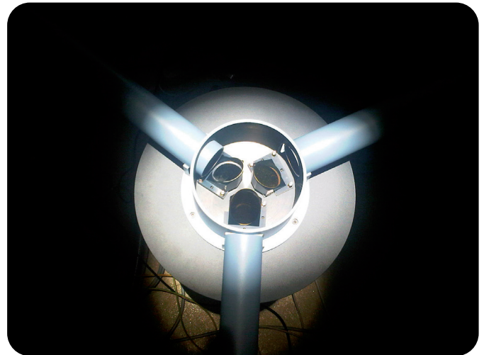
Fig. 3: Close view onto the 3 \times 120^\circ reflective beam splitter that evenly distributes the IR radiation to the input ports of the IFS 125HR spectrometers.

3 \times 120^\circ reflective beam splitter that evenly distributes the radiation to the input ports of the spectrometers (see fig.3).