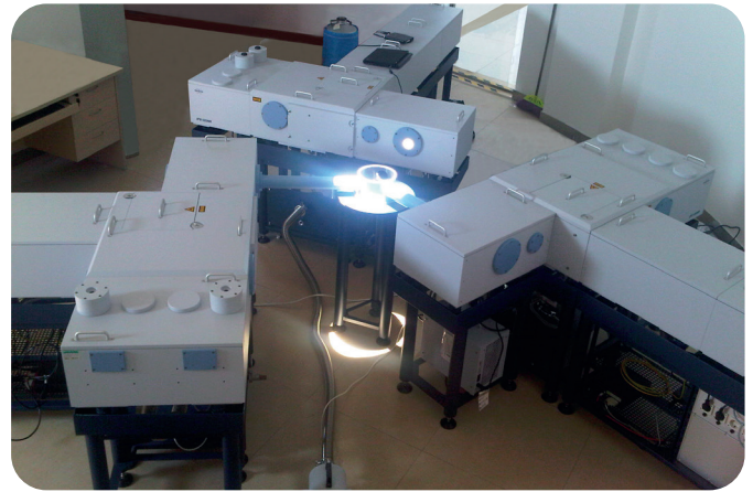
Fig. 2: Arrangement of three compact IFS 125HR spectrometers installed in the new astronomical observatory at the Shenzhen Meteorological Bureau in China.

As shown in the fig. 2 the solar beam is captured by a large Chinese made solar tracker mounted under the dome of the observatory. The solar radiation is then guided down to a