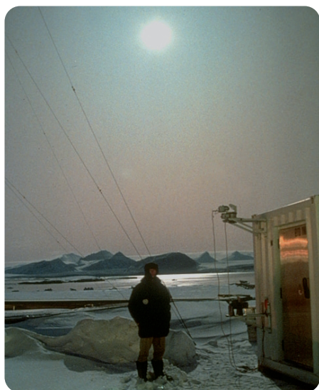
Fig. 4: Measurement during the polar night using the moon.

The above described installation examples demonstrate the outstanding IFS 125HR instrument flexibility and high measurement sensitivity for high resolution atmospheric studies in the IR, NIR, VIS and UV spectral ranges [3,4]. No other commercial high resolution FT-IR spectrometer would be able to fulfil such application requests. More detailed information about the IFS 125HR as well for laboratory application is described in the instrument brochure.