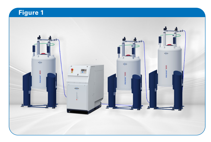
Figure 1: Artist's view of the setup described in the installation example with one recovery unit and three NMR magnets. The high pressure storage is not shown.

Table 4: Steady-state helium consumption of the magnets in the installation example.