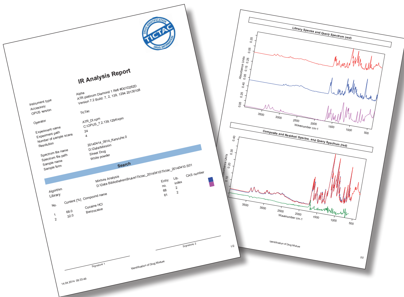
Fig 3: Analysis report of the identification of street drug components using the mixture analysis function of the OPUS software together with the TICTAC FTIR drug library.