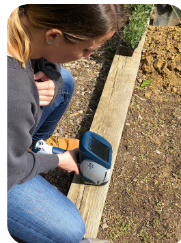
The S1 TITAN's "Soil" method results indicated the presence of arsenic (As) when the soil was screened to determine its health