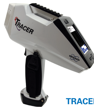
TRACER 5 Handheld XRF analyzer Na (11) to U (92)