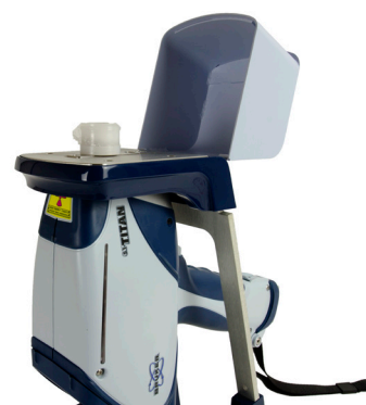
S1 TITAN Handheld XRF analyzer Mg (12) to U (92)