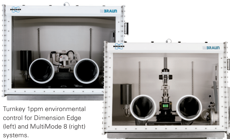
Turnkey 1ppm environmental control for Dimension Edge (left) and MultiMode 8 (right) systems.