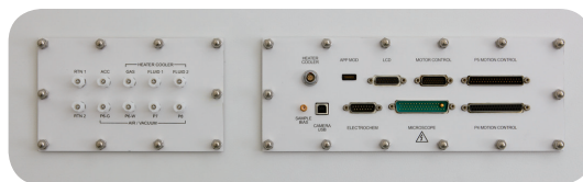
Complete AFM signal feedthrough enabling all AFM modes and accessories

Overcoming the chemical sensitivity challenge in green energy research requires the highest grade environmental control. Bruker has teamed up with MBraun, the leader in glove box systems and inert gas technology, to provide solutions for the most stringent atomic force microscopy environmental control requirements. The MBraun Labmaster series glove box, in conjunction with the MB 20G inert gas purification system, guarantees levels below 1ppm for both, oxygen and water. The integration of Bruker AFMs with this glove box enables seamless 1ppm gas control from sample preparation to characterization, so the sample is never exposed to an uncontrolled environment.