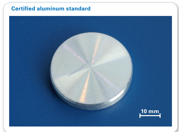
Fig. 1 Photograph of the analyzed specimen Alcoa Deltalloy® 4032

The example demonstrated here shows the improvement of trace element detection in a certified aluminum alloy (Alcoa Deltalloy® 4032, Fig. 1) with Micro-XRF on SEM.